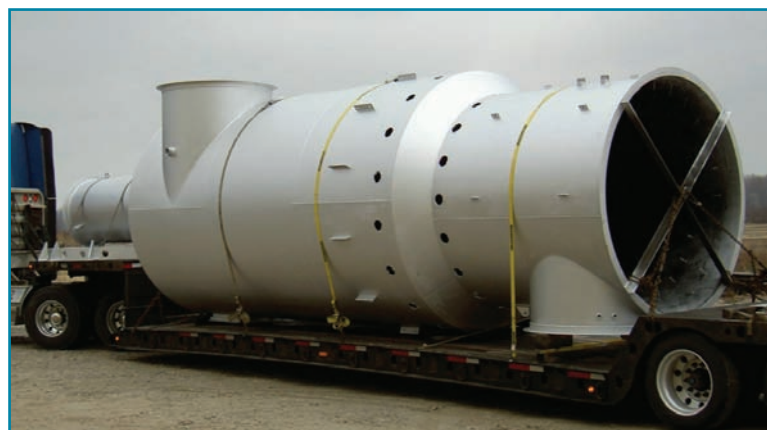
A low NO x Oxidizer is transported by truck to the Howard City, Mich. Waste-to-Energy site being built by Heat Transfer International.

www.percival-scientific.com info@percival-scientific.com