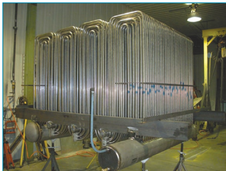
High pressure HTI Metal Exchanger being pressure tested prior to installation at the Sietsema Waste-to-Energy site.

Specializing in custom designed, Starved Air-Low Temperature (SALT) biomass gasification systems, HTI has worked closely with Sietsema to design a plant that intimately addresses the feedstock to be used, local codes and energy needs. A "one size does not fit all" motto called for detailed analyses of turkey litter and ultimately led to the selection of a retort style gasifier. This gasifier will be housed in a newly erected 15,000 sq. ft. building, separate from the feed mill that will also serve as