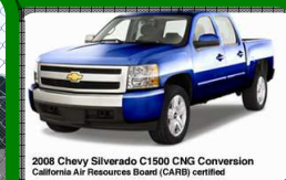
2008 Chevy Silverado C1500 CMG Conversion California Air Resources Board (CARB) certified